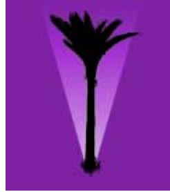
Lawn Garden Lighting