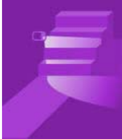
Step Light Eyelid